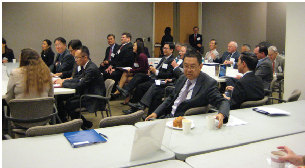
MDI bankers meet with FDIC San Francisco Region officials at the San Francisco Regional MDI Roundtable in Los Angeles, CA in December 2016.

The FDIC also sponsored a Community Banking Conference in April 2016, Strategies for Long-Term Success , a daylong discussion regarding future challenges and opportunities for community banks in the United States.