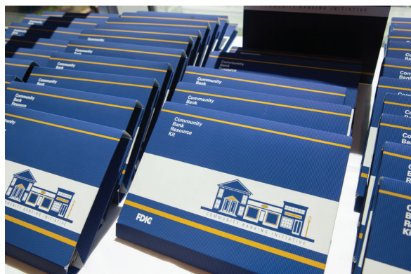
The FDIC distributed a Community Bank Resource Kit in 2016 to all community banks, including MDIs, with useful tools for community bankers.

In 2016, the FDIC provided 135 individual technical assistance sessions on over 65 risk management and compliance topics, including: