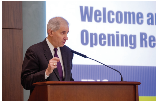
In opening remarks, FDIC Chairman Gruenberg emphasizes the importance of community banks to the financial system and the economy.

The FDIC also sponsored a Community Banking Conference in April 2016, Strategies for Long-Term Success , a daylong discussion regarding future challenges and opportunities for community banks in the United States.