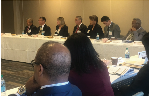
MDI bankers meet with FDIC Chicago Region officials at the Chicago Regional MDI Roundtable in November 2016.

corporate governance; strategic planning; director responsibilities; compliance guidance; concentration risk management; and bank merger and acquisition.